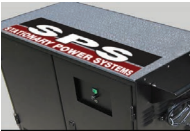
Customized work surface