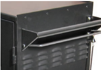
Control handle and brake

The SAFE Cabinet System can be used as a rolling workstation, because it contains everything needed to swap a failed battery out with a fresh one. The top of a SAFE cabinet has a removable and washable non-slip heavy duty mat on the work surface. This mat may be customized with logos or designs of the customer's choosing. This concept can be leveraged for co-op advertising dollar offset.