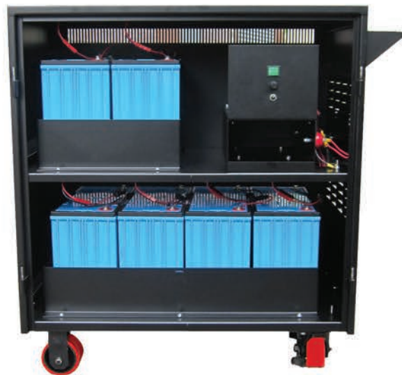
The SPS SAFE Cabinet System pictured above with and without doors. See back-page for technical specs and features

Stationary Power System's SAFE (Stored and Fully Energized) Cabinet System is the smart solution for rapid response to battery failure. With the fail-safe SAFE, precious downtime is reduced to just minutes with this portable, self-monitoring, float-charged battery-backup, cabinet system.